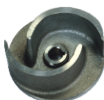
Stainless Steel Impeller